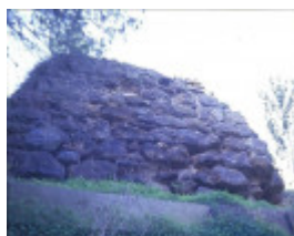
h00389 portarlington mill turner crt portarlington remains of rear boiler house she project 2003