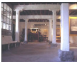
h00389 portarlington mill turner crt portarlington ground floor she project 2003