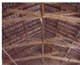
h00389 portarlington mill turner crt portarlington scissor beam construction under roof she project 2003