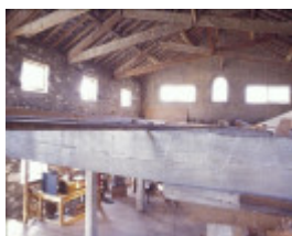
h00389 portarlington mill turner crt portarlington top floor north end she project 2003