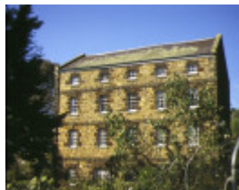
1 portarlington mill turner court portarlington front view mar1997