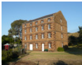
PORTARLINGTON MILL SOHE 2008