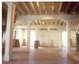
h00389 portarlington mill turner crt portarlington first floor construction she project 2003