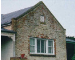
laurence park homestead buchter road batesford front window detail publication