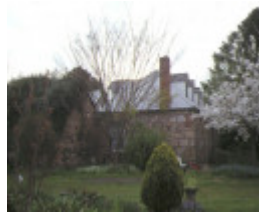
former travellers rest inn batesford side view oct1985