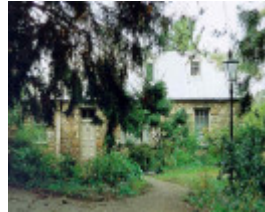
former travellers rest inn batesford front elevation publication