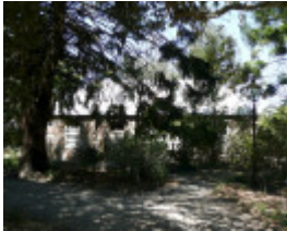
FORMER TRAVELLERS REST INN SOHE 2008