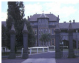
1 sacred heart convent & college retreat rd newtown front view