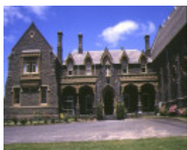
sacred heart convent & college retreat rd newtown entrance