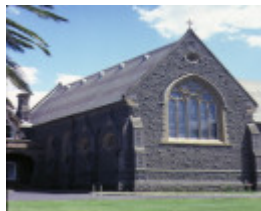
sacred heart convent & college retreat rd newtown chapel front