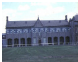
sacred heart convent & college retreat rd newtown rear building