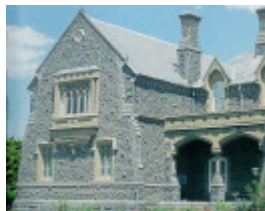
sacred heart convent & college reatreat road newtown front elevation publication