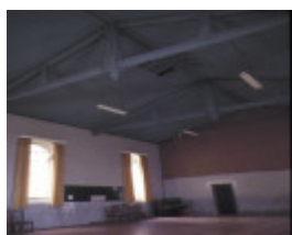
former baptist church aberdeen street newtown interior