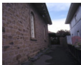
former baptist church aberdeen street newtown side view