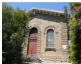
FORMER BAPTIST CHURCH SOHE 2008