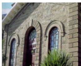
former baptist church aberdeen street newtown front elevation publication