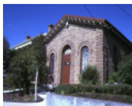
former baptist church aberdeen street newtown chapel front view