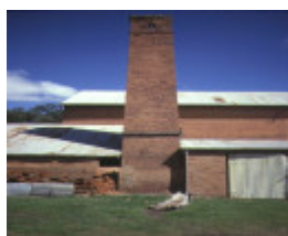
day's four mill complex murchison chimney nov1984