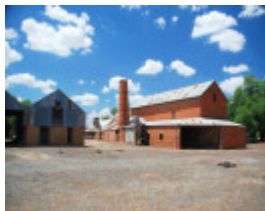
DAY'S FLOUR MILL COMPLEX SOHE 2008