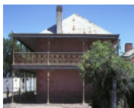
day's flour mill complex murchison side view of homestead