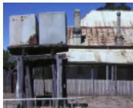
day's flour mill complex murchison corrugated iron building