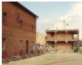
1 day's flour mill complex murchison mill & homestead