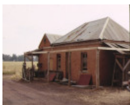
day's flour mill complex murchison gate lodge