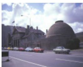
Missions to Seamen Flinders Street Extension Melbourne Dome January 1985