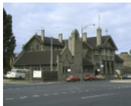
missions to seamen flinders street extension melb side elevation feb1986