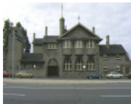
1 missions to seamen flinders street extension melbourne front elevation feb1986