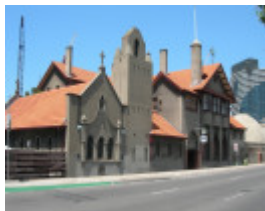
MISSIONS TO SEAMEN SOHE 2008