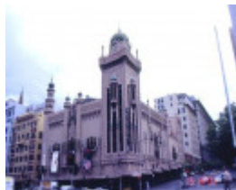
h00438 1 forum theatre flinders street melbourne external view she project 2003