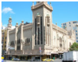
FORUM AND RAPALLO CINEMAS SOHE 2008