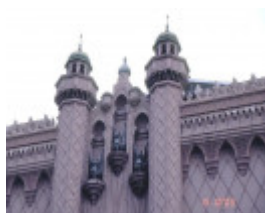
h00438 forum theatre flinders street melbourne flinders street statues she project 2003