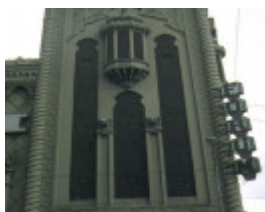
former state theatre flinders street melbourne external detail side sign