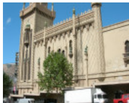
FORUM AND RAPALLO CINEMAS SOHE 2008