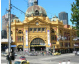
FLINDERS STREET RAILWAY STATION COMPLEX SOHE 2008