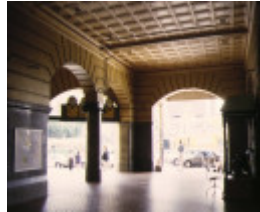
flinders street railway station complex flinders street melbourne entrance foyer