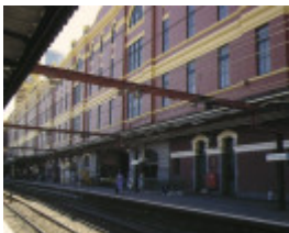
flinders street railway station complex flinders street melbourne side view