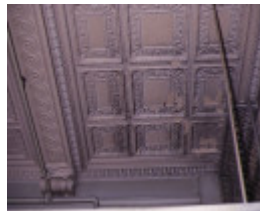
flinders street railway station complex flinders street melbourne pressed metal ceiling