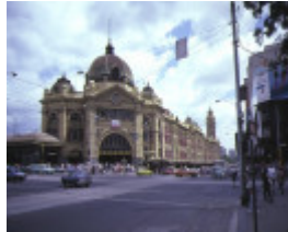
1 flinders street railway station complex flinders street melbourne front view feb1985