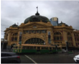
FLINDERS STREET RAILWAY STATION COMPLEX October 2016