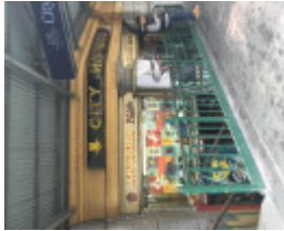
FLINDERS STREET RAILWAY STATION COMPLEX October 2016