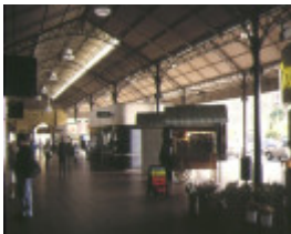
flinders street railway station complex flinders street melbourne interior along st kilda road