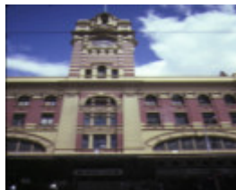
flinders street railway station complex flinders street melbourne tower view