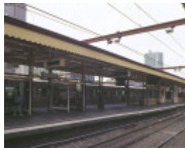
flinders street railway station complex flinders street melbourne platform view 1998