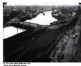
Flinder Street 1910.JPG