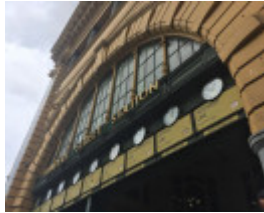
FLINDERS STREET RAILWAY STATION COMPLEX October 2016