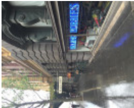
FLINDERS STREET RAILWAY STATION COMPLEX October 2016