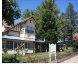
T12049 Platanus X acerifolia