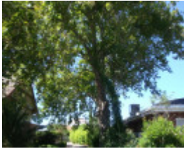
T12049 Platanus X acerifolia