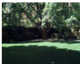
T11872 Platanus x acerifolia