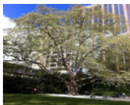
T11872 Platanus x acerifolia