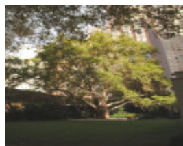
T11872 Platanus x acerifolia