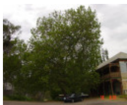
T11684 Platanus x acerifolia