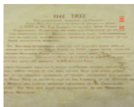
T11684 Platanus x acerifolia