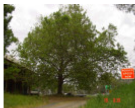
T11684 Platanus x acerifolia