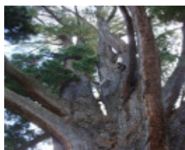
T11337 Pinus radiata