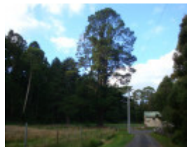
T11337 Pinus radiata