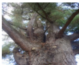
T11337 Pinus radiata