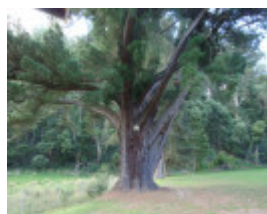
T11337 Pinus radiata