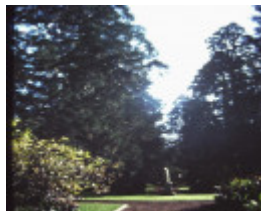
T11301 Sequoiadendron giganteum