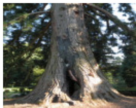
T11301 Sequoiadendron giganteum