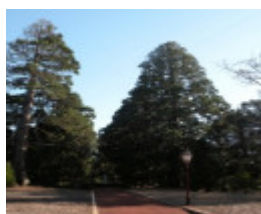
T11301 Sequoiadendron giganteum