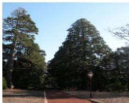
T11301 Sequoiadendron giganteum