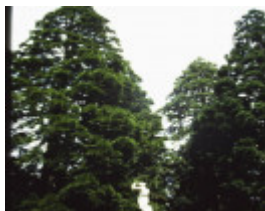
T11301 Sequoiadendron giganteum