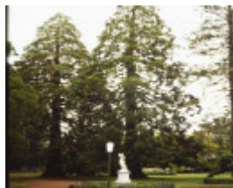
T11301 Sequoiadendron giganteum