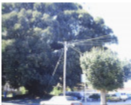
T11171 Ficus macrophylla