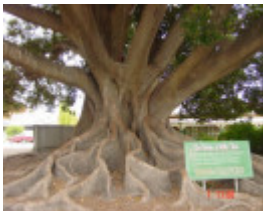
T11171 Ficus macrophylla