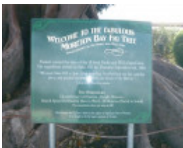
T11171 Ficus macrophylla sign