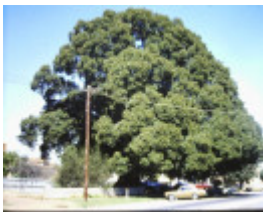
T11171 Ficus macrophylla