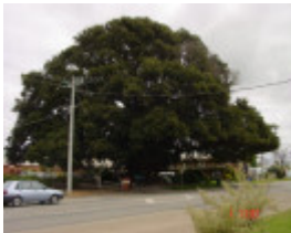
T11171 Ficus macrophylla