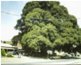
T11171 Ficus macrophylla