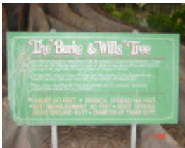
T11171 Ficus macrophylla