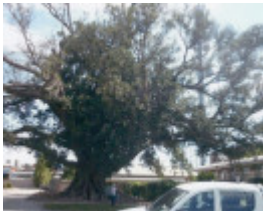
T11171 Moreton Bay Fig 22 Oct 2011