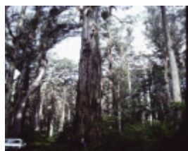
T11018 Eucalyptus denticulata