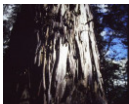
T11018 Eucalyptus denticulata