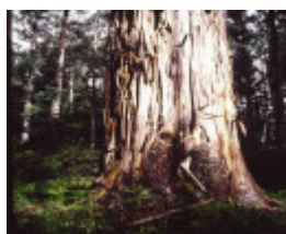
T11018 Eucalyptus denticulata