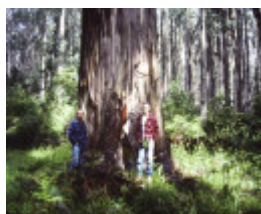
T11018 Eucalyptus denticulata