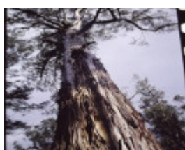
T11018 Eucalyptus denticulata