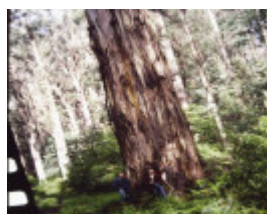
T11018 Eucalyptus denticulata