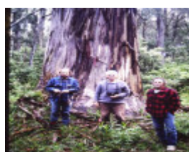
T11018 Eucalyptus denticulata