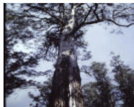
T11018 Eucalyptus denticulata