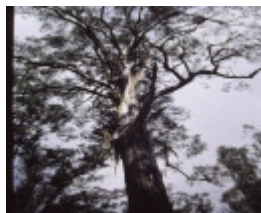
T11018 Eucalyptus denticulata