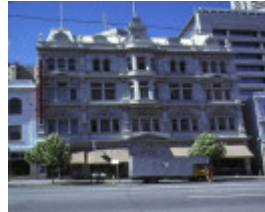
1 former salvation army temple bourke street melbourne front view jan1979