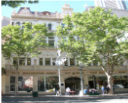
SALVATION ARMY TEMPLE SOHE 2008