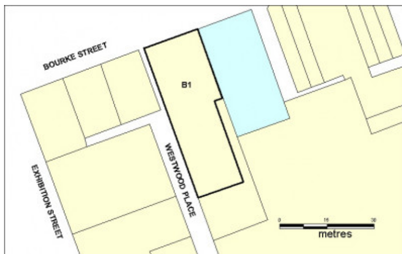
Salvation Army Temple Bourke Street Extent Of Registration Plan March 2000