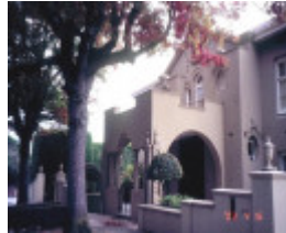
h00935 katanga glenferrie road malvern front side view she project 2003