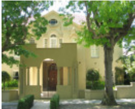
KATANGA SOHE 2008