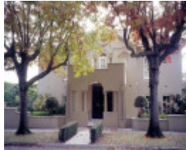
h00935 katanga glenferrie road malvern front view she project 2003