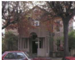
katanga glenferrie road malvern front elevation