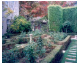
h00935 katanga glenferrie road malvern garden she project 2003