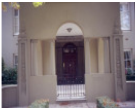
h00935 katanga glenferrie road malvern front gate she project 2003