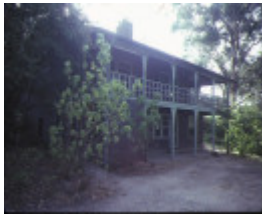
1 leighwood mountjoy parade lorne front view mar1985