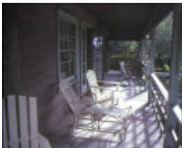
leighwood mountjoy parade lorne verandah mar1985