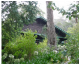
LEIGHWOOD SOHE 2008