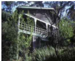
leighwood mountjoy parade lorne side view mar1985