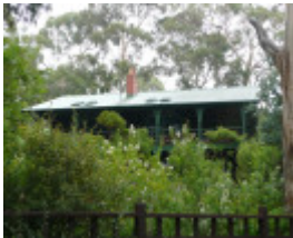
LEIGHWOOD SOHE 2008