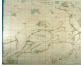
B1305 Napier Murals