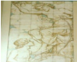
B1305 Napier Murals