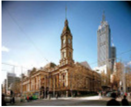
B1305 Melbourne Town Hall