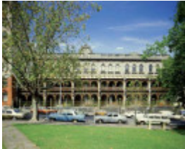
B1937 Tasma Terrace