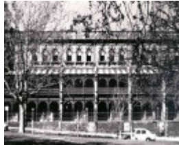
B1937 Tasma Terrace