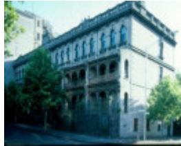
B1937 Tasma Terrace