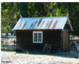
MORANGHURK SOHE 2008