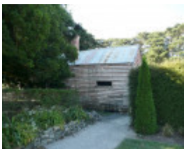
MORANGHURK SOHE 2008