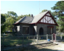
MORANGHURK SOHE 2008