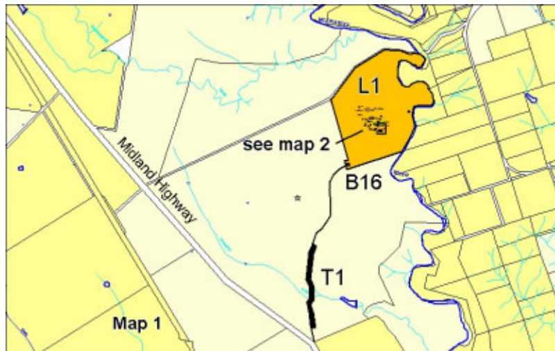
H00266 moranghurk 1 plan