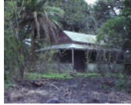
Moranghurk Lethbridge Side View Small Cottage