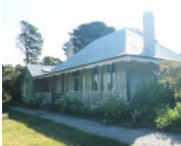
MORANGHURK SOHE 2008