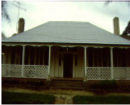
H00266 moranghurk h266 house from north July 2001