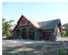
MORANGHURK SOHE 2008