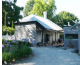
MORANGHURK SOHE 2008