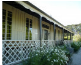
MORANGHURK SOHE 2008