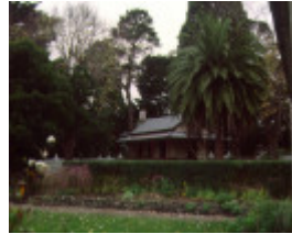
H00266 moranghurk h266 manager's residence July 2001