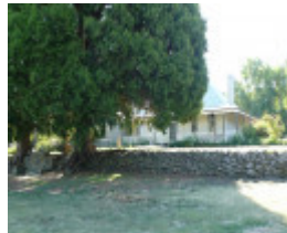
MORANGHURK SOHE 2008