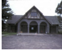
Moranghurk Motor Garage 1920s