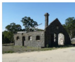
MORANGHURK SOHE 2008