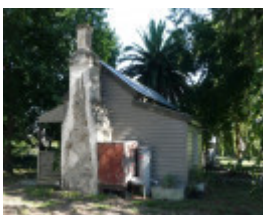
MORANGHURK SOHE 2008