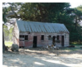
MORANGHURK SOHE 2008