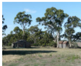
MORANGHURK SOHE 2008