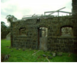
H00266 moranghurk h266 stables July 2001