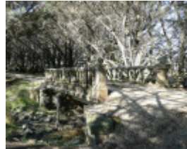
MORANGHURK SOHE 2008