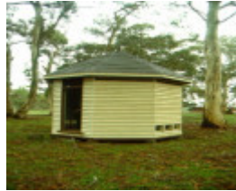
H00266 moranghurk h266 meat house July 2001