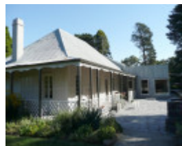
MORANGHURK SOHE 2008