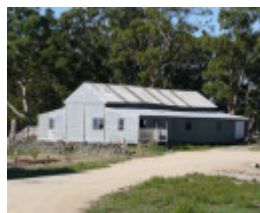
MORANGHURK SOHE 2008