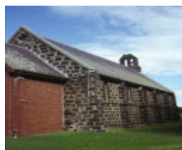
st marks on the hill leopold rear view