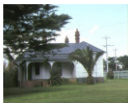
st marks on the hill leopold vicarage