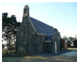
ST MARKS ON THE HILL SOHE 2008