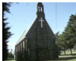
1 st marks on the hill leopold front view