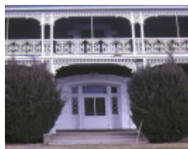
pirra homestead windermere road lara entrance sep1982