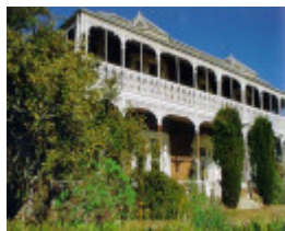
pirra homestead windermere road lara front view publication