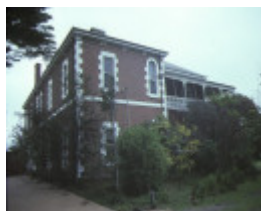
pirra homestead windermere road lara side view sep1984