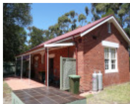
PIRRA HOMESTEAD SOHE 2008