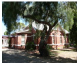
PIRRA HOMESTEAD SOHE 2008