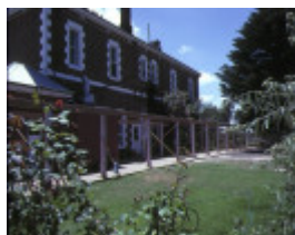
pirra homestead windermere road lara rear walkway & pergolas jan1985