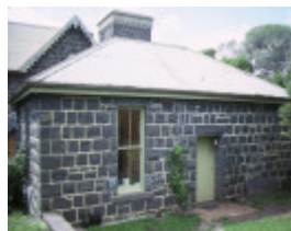
elcho homestead elcho road lara rear view bluestone