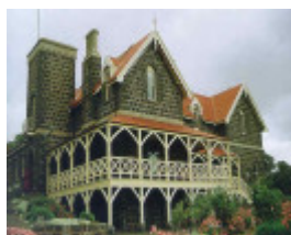
elcho homestead elcho road lara corner view publication