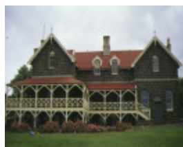
1 elcho homestead lara front view