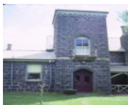
elcho homestead elcho road lara tower view