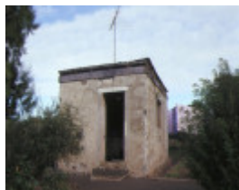
elcho homestead elcho road lara outbuilding