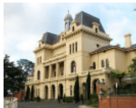
FORMER WILLSMERE HOSPITAL SOHE 2008