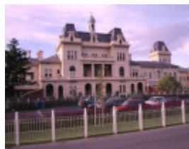
1 former willsmere hospital kew front view june 1995