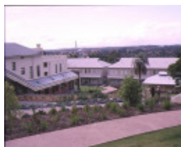
former willsmere hospital kew view of grounds june 1995