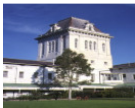
former willsmere hospital kew view of tower jun1988