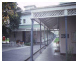
former willsmere hospital kew hospital wing jun1984