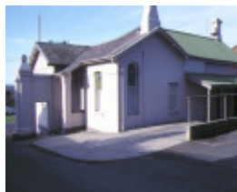
former willsmere hospital kew gatehouse june 1988