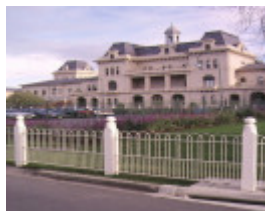
former willsmere hospital kew front elevation jun1995