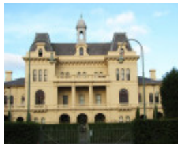
FORMER WILLSMERE HOSPITAL SOHE 2008