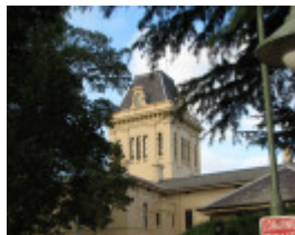
FORMER WILLSMERE HOSPITAL SOHE 2008