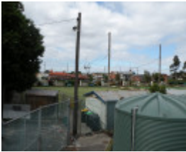
Bridges Reserve and City Oval