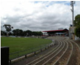
Bridges Reserve and City Oval