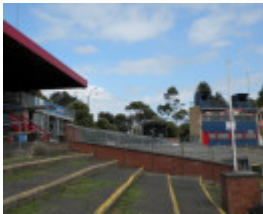
Bridges Reserve and City Oval