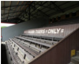
Bridges Reserve and City Oval