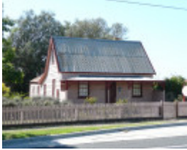
GERMAN COTTAGE SOHE 2008