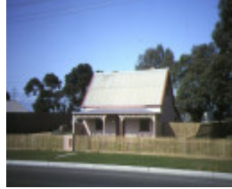
1 german cottage torquay road grovedale front view sep1991