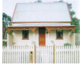
german cottage torquay road grovedale front view publication