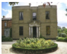
1 lunan house geelong west front elevation lunan house apr1997