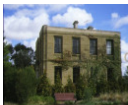
lunan house geelong west rear elevation lunan house apr1997