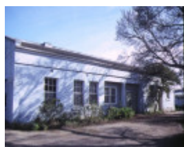
lunan house geelong west side view of wing jul1984