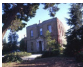
lunan house lunan avenue drumcondra front view