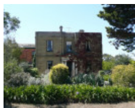
LUNAN HOUSE SOHE 2008