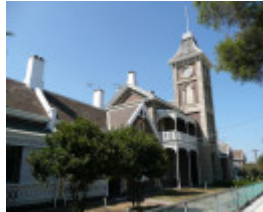
AUSTIN HALL AND TERRACE COMPLEX SOHE 2008