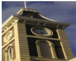
austin hall & terrace complex yarra & mundy streets south geelong detail of clock tower mar1995