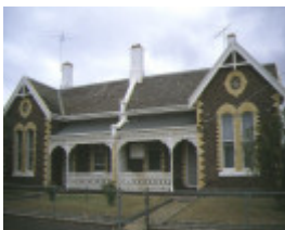
austin hall & terrace complex yarra & mundy streets south geelong terrace complex apr1997