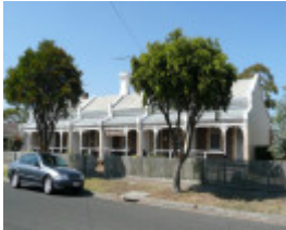
AUSTIN HALL AND TERRACE COMPLEX SOHE 2008