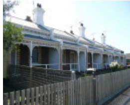
AUSTIN HALL AND TERRACE COMPLEX SOHE 2008