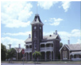
austin hall & terrace complex yarra & mundy streets south geelong front view of austin hall jan1997