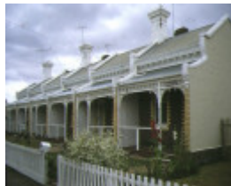
austin hall & terrace complex yarra & mundy streets south geelong row of terrace houses yarra street apr1997