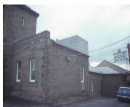
former telegraph station ryrie street geelong side elevation jul1984