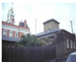
former telegraph station ryrie street geelong rear view jul1984