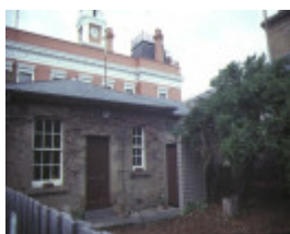
former telegraph station ryrie street geelong rear entry jul1984