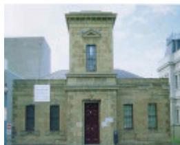
former telegraph station ryrie street geelong front view publication