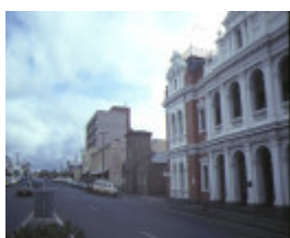
former telegraph station ryrie street geelong streetscape aug1984