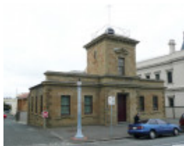
FORMER TELEGRAPH STATION SOHE 2008