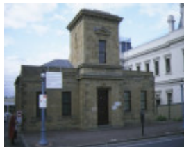
1 former telegraph station ryrie street geelong front elevation apr1997