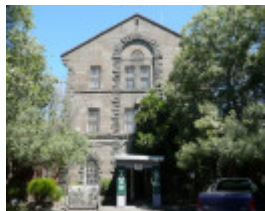
FORMER HM TRAINING PRISON SOHE 2008