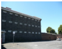
FORMER HM TRAINING PRISON SOHE 2008