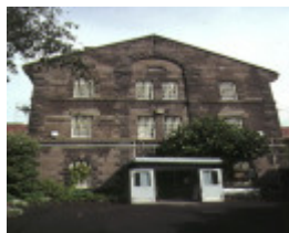
former hm training prison geelong forecourt north wing sep1992