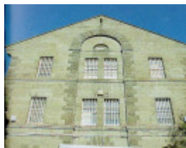
former hm training prison myers street geelong front elevation publication