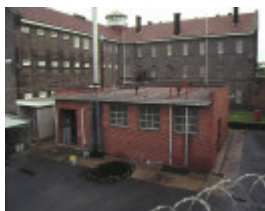
former hm training prison geelong northeast yard & services building aug1992