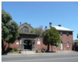
FORMER HM TRAINING PRISON SOHE 2008