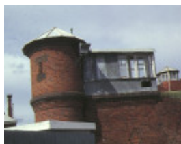
former hm training prison geelong watch tower sep1992