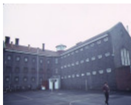
1 former hm training prison geelong east wing south east yard jul1984