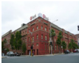
FORMER STRACHAN MURRAY AND SHANNON WOOL WAREHOUSES SOHE 2008