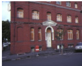
former strachan murray & shannon wool warehouse geelong view of entrance jul1985