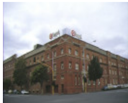
1 former strachan murray & shannon wool warehouse geelong corner view apr1997