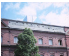
former strachan murray & shannon wool warehouse geelong view of top floor oct1987