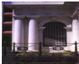
trustees chambers malop street geelong iron work