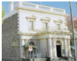
trustees chanbers malop street geelong front detail publication