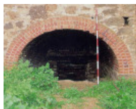
lime kiln complex limeburners point geelong arched entrance publication