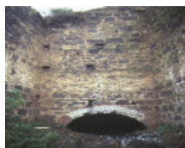
lime4 kiln complex limeburners point geelong kiln detail