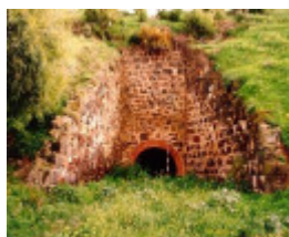
lime kiln complex limeburners point geelong front view