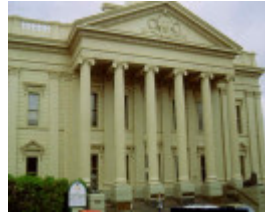
geelong town hall gheringhap street geelong front elevation publication