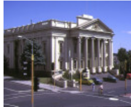
geelong town hall gheringhap street geelong front corner view