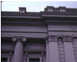
geelong town hall gheringhap street geelong column detail