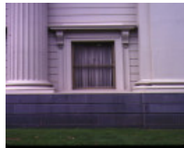
geelong town hall gheringhap street geelong window detail