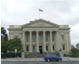
GEELONG TOWN HALL SOHE 2008