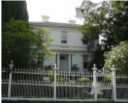
MERCHISTON HALL SOHE 2008