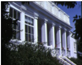
merchiston hall garden street geelong front entrance