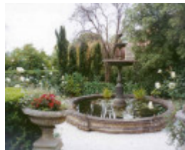
h00192 merchiston hall garden street geelong fountain