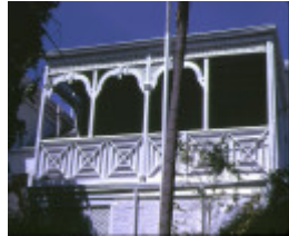
merchiston hall garden street geelong balcony detail view