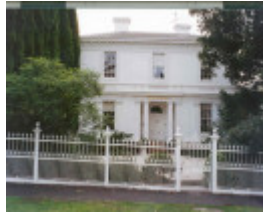
h00192 1 merchiston hall garden street geelong street view