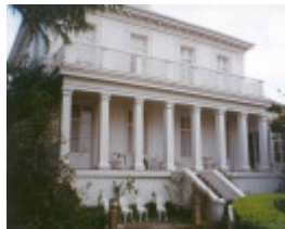
h00192 merchiston hall garden street geelong rear