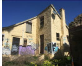
2019 Inn building