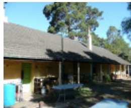
OLD SWAN INN SOHE 2008