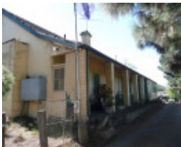
OLD SWAN INN SOHE 2008