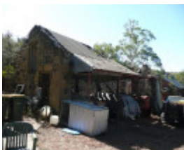
OLD SWAN INN SOHE 2008