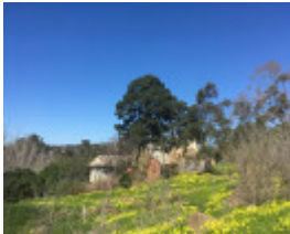
2019 outbuildings and Inn viewed from the north