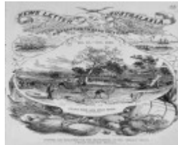
1860 Samuel Calvert