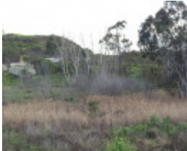
2019 View of the Swan Inn from across the River