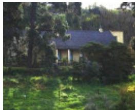
h00267 old swan inn fyansford