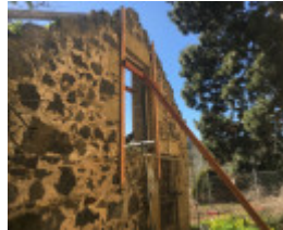
2019 stable ruins