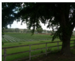
4957_Bacchus Marsh Avenue of Honour_25 December 2009_HV_020.JPG