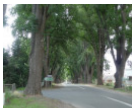
4957_Bacchus Marsh Avenue of Honour_25 December 2009_HV_039.JPG