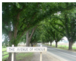
4957_Bacchus Marsh Avenue of Honour_25 December 2009_HV_019.JPG