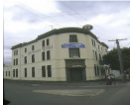
1 terminus hotel geelong front corner view apr1997