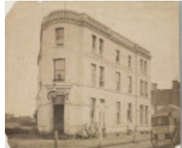
Terminus Hotel, c.1861, SLV, acc H13864.jpg