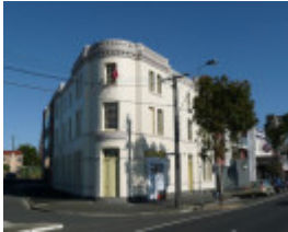
TERMINUS HOTEL SOHE 2008