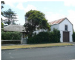
WARRINGAH SOHE 2008