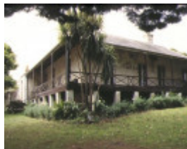
1 warringah mercer street queenscliff front view oct1995