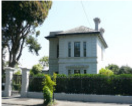
MILTON HOUSE SOHE 2008