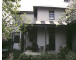
1 milton house aphrasia street geelong verandah