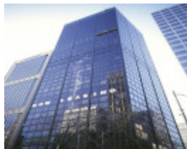
1 fmr bhp house william street melb front elevation