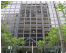
FORMER BHP HOUSE SOHE 2008