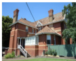
NAPIER CLUB SOHE 2008