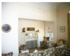
NAPIER CLUB SOHE 2008