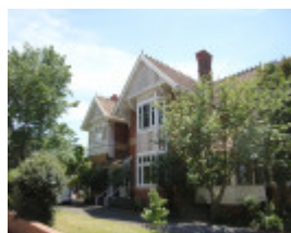
NAPIER CLUB SOHE 2008