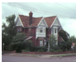
1 napier club thompson street hamilton front view nov1980