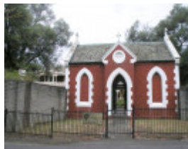
VAUCLUSE COLLEGE SOHE 2008