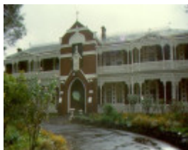
1 vaucluse college richmond convent 1999