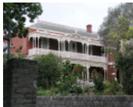
VAUCLUSE COLLEGE SOHE 2008