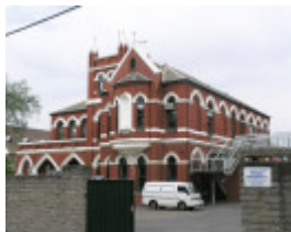
VAUCLUSE COLLEGE SOHE 2008