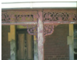
residence gisborne rd bacchus marsh detail of iron lace