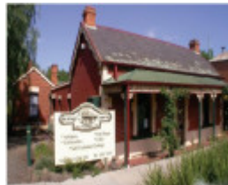
h00505 heritage express cottage h0505