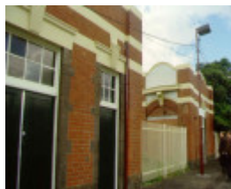
essendon railway station complex store buildings sw oct 1998