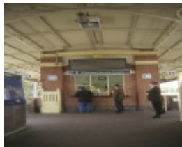
essendon railway station complex buckley street essendon central platform ticket box oct1998