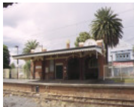
essendon railway station complex buckley street essendon platform 1 view oct1998