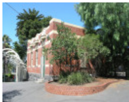
ESSENDON RAILWAY STATION COMPLEX SOHE 2008