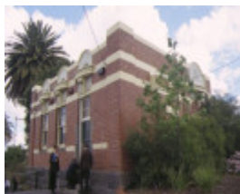
essendon railway station complex buckley street essendon street elevation oct1998