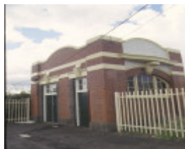
essendon railway station complex buckley street essendon store building oct1998