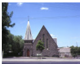
1 church of christ trinity church la trobe terrace geelong front view jan1981