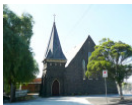
CHURCH OF CHRIST SOHE 2008