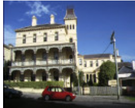
1 ozone hotel gellibrand street queenscliff front elevation sep1987