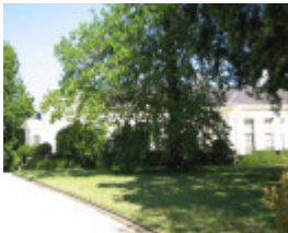
CRANLANA SOHE 2008