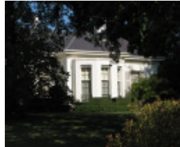
CRANLANA SOHE 2008