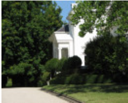
CRANLANA SOHE 2008