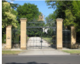
CRANLANA SOHE 2008