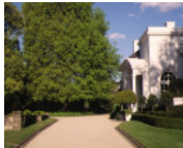
1 cranlana clendon road toorak drive & entrance